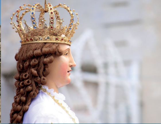
2 JULY AND MARIA SS. DELLA BRUNA