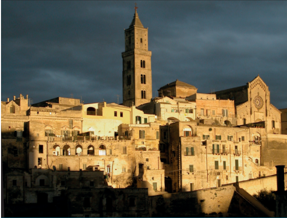
CATHEDRAL OF MARIA SS. DELLA BRUNA

S. Michele Arcangelo (Murgia Timone) Also known as S. Nicola all'Appia, this church was used as one of the settings for the film Nativity .