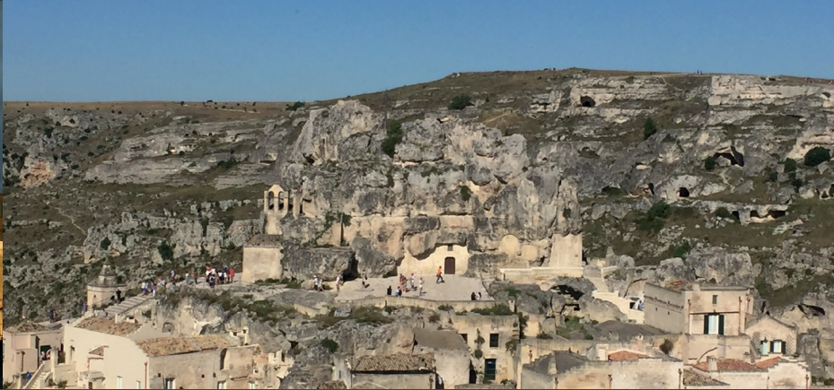
CHURCHES OF S. MARIA DE IDRIS AND S. GIOVANNI IN MONTERRONE